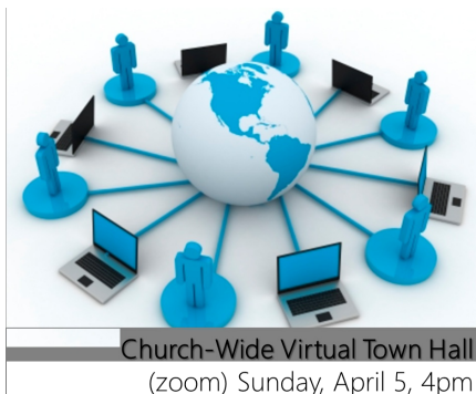
Church-Wide Virtual Town Hall (zoom) Sunday, April 5, 4pm

Join us for a Virtual Town Hall on Sunday, April 5th at 4:00PM.